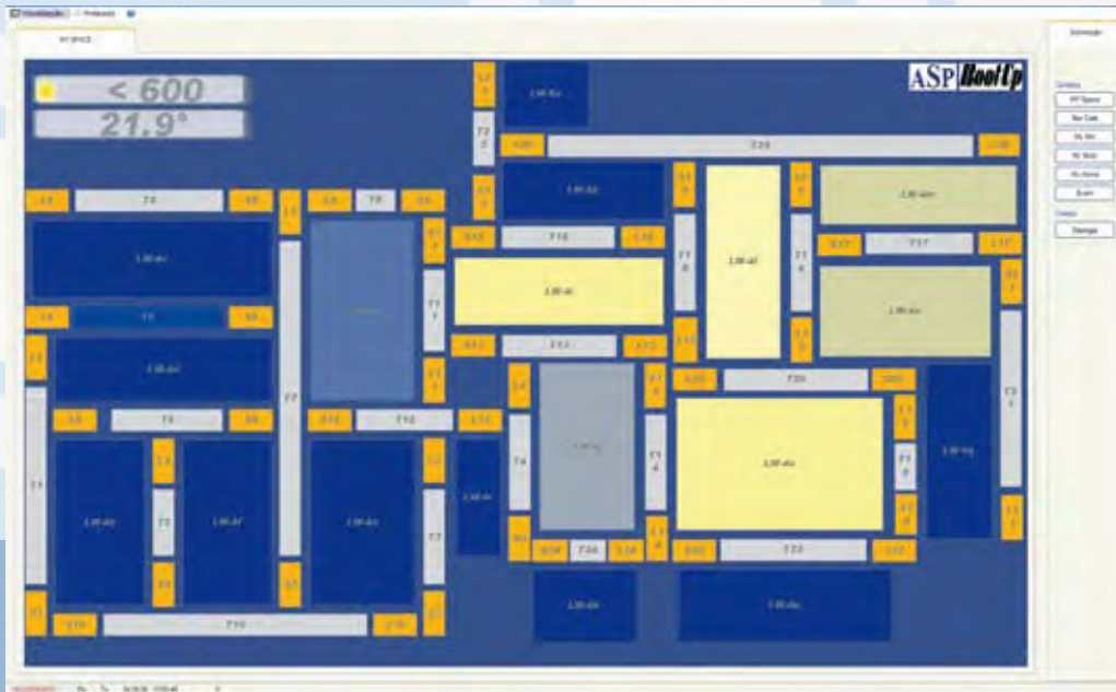
myHome Control user interface.